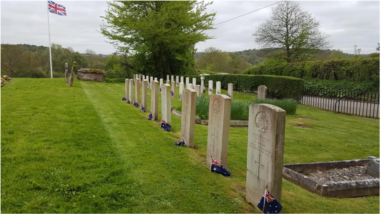
St. Edith's Churchyard, Baverstock